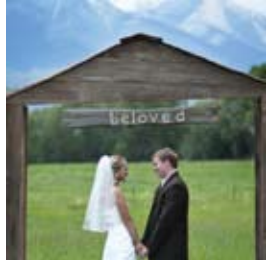
Baby Doe Studios 719.207.0650 www.BabyDoeStudios.Zenfolio.com