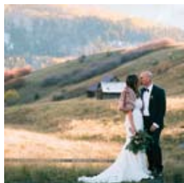
Winter Tree Studios 719.419.8840 www.WinterTreeStudios.com