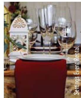
Settings Event Rental

The Asian Palate www.TheAsianPalate.com 719.395.6679