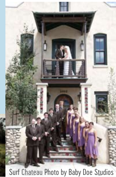
Surf Chateau

For other services such as hair and makeup and the most up-to-date listing of our businesses who can assist you on your special day please go to our website www.BuenaVistaColorado.org/Weddings-Events